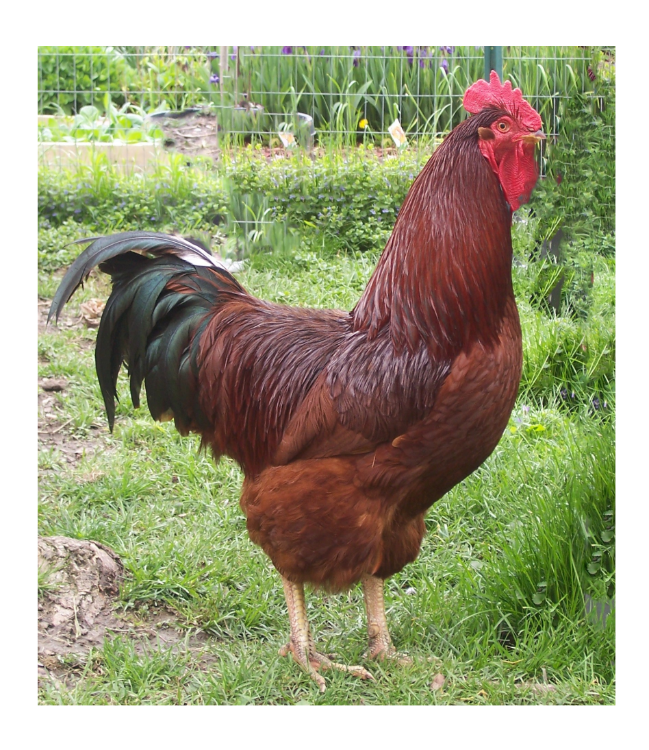
The Red Rooster